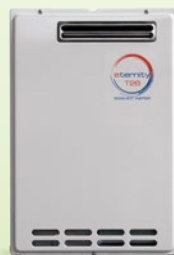
Eternity Gas Booster

Gas boosted models feature Chromagen's brilliant Eternity continuous flow water heaters, featuring a high 6 Star energy rating to ensure perfect hot water whenever you need it, with low running costs. Electric-boostered models feature an in-tank heating element that activates only when the stored water temperature drops below a set point.