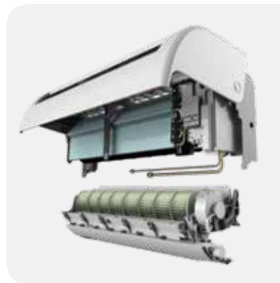
Quick access fan

The D Series design innovation extends to elements of maintenance as well. Featuring a unique, slide out chassis design, the indoor unit allows for convenient access and the opportunity to save time during maintenance.