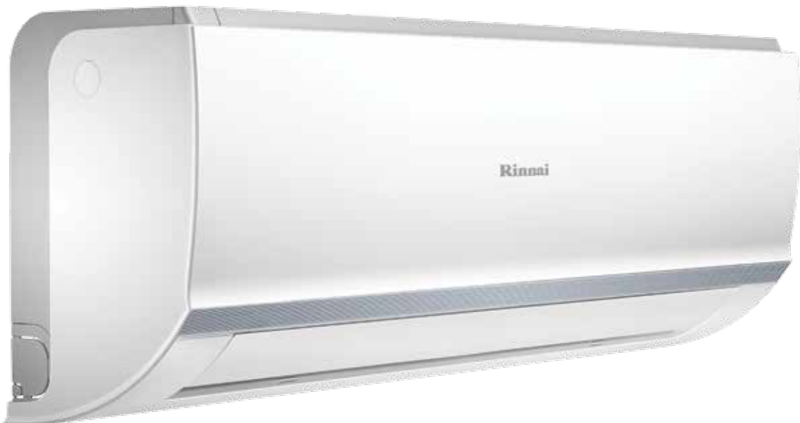
Indoor Header unit