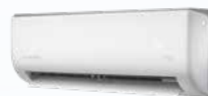
Serene wall hung split